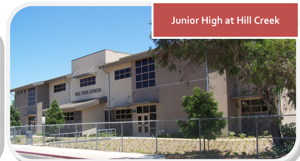
Junior High at Hill Creek