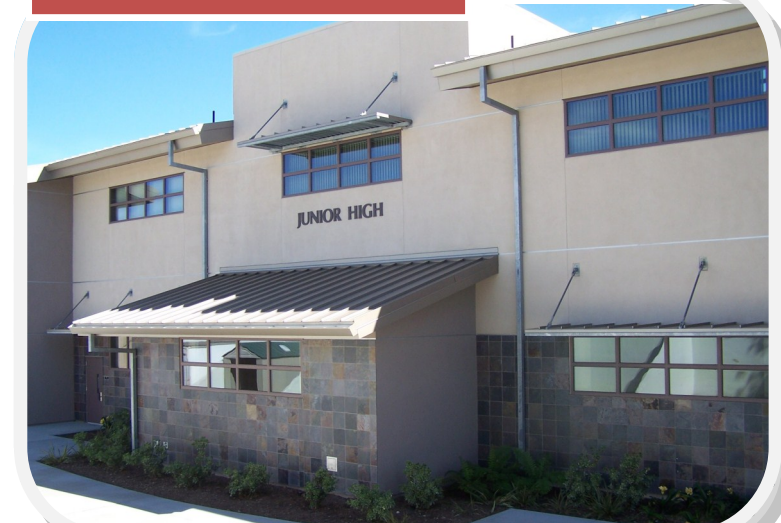
Junior High at Rio Seco