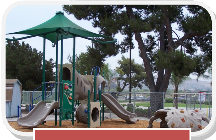
Play Structure at Rio Seco