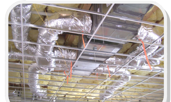
Individual Heating & Air Conditioning Units for Every Classroom