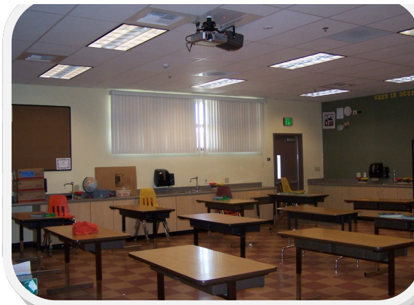
Science Classroom at Rio Seco