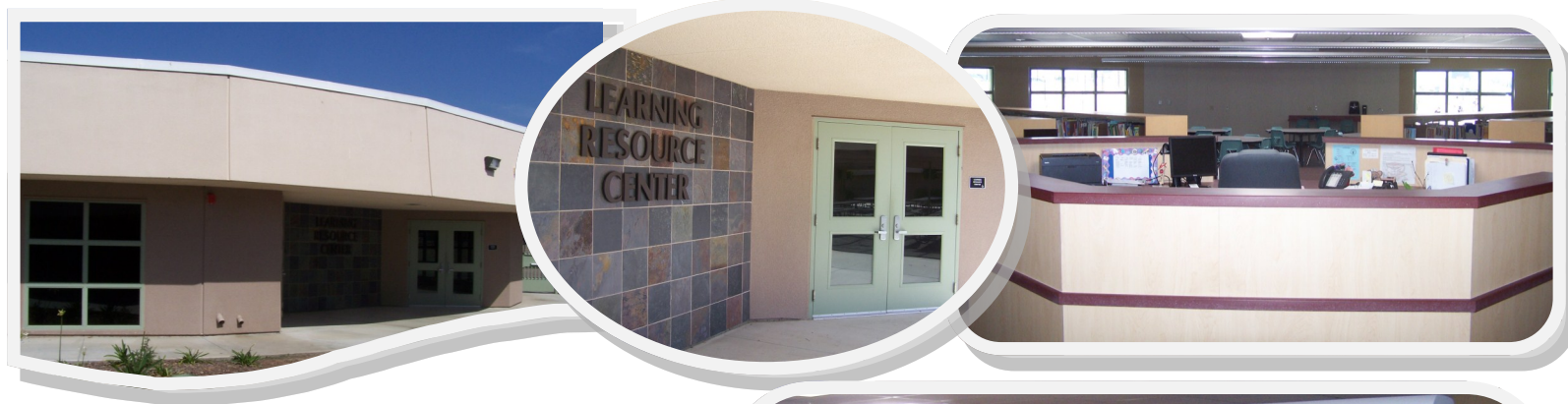
Learning Resource Center

"In order to construct, acquire, renovate, and upgrade school facilities and provide major repairs and upgrades of existing school facilities at schools of the Santee School District, and in so doing, increase safety and educational effectiveness of classrooms for students, shall the Santee School District be authorized to issue Bonds in an amount not to exceed $60,000,000."